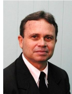
Mr. Colm Imbert Chairman

TENTH PARLIAMENT, REPUBLIC OF TRINIDAD AND TOBAGO