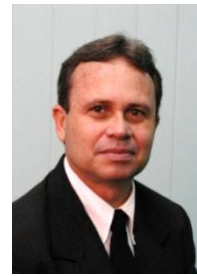
Mr. Colm Imbert Chairman

TENTH PARLIAMENT, REPUBLIC OF TRINIDAD AND TOBAGO