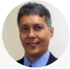
Senator Anthony Vieira

Independent Senator, Parliament of Trinidad and Tobago