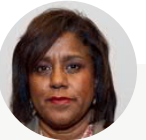
Senator the Hon. Paula Gopee-Scoon

Senator the Hon. Nigel de Freitas was first appointed a Government Senator and served as Vice-President of the Senate in the 11th and 12th Republican Parliament until March 2022 when he was appointed Minister in the Ministry of Agriculture, Lands and Fisheries. Senator de Freitas is an aquatic specialist with over 16 years' experience specialising in aquatic ecosystem management. He holds a bachelor's degree in marine and freshwater biology and a master's degree in aquaculture from the University of Guelph, Ontario, Canada. He is also certified with the Canadian Certifications Approvals Board as an EPT for Water Quality Assessment and Fisheries Management, a member of the World Aquaculture Society and American Fisheries Association. Mr. Nigel de Freitas was elected President of the Senate in January 2023.