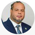
Hon. Stacy Mather

Deputy Speaker, House of Assembly of the British Virgin Islands