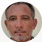
Dr. the Hon. Godwin Friday MP