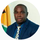
Hon. Warren Kwame Eusi Mc Coy MP

Minister within the Office of the Prime Minister with responsibility for Information and Public Affairs, Parliament of Guyana