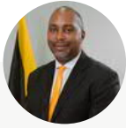
Hon. Julian J. Robinson MP Member, Parliament of Jamaica

Julian is Chairman of the Public Accounts Committee and Shadow Minister for Finance. He was first elected to Parliament in 2011 and is serving his third term. From 2012 to 2016 he served as Minister of State in the Ministry of Science, Technology, Energy and Mining. He served as General Secretary of the People's National Party from 2012 to 2016 and as a Member of the Electoral Commission of Jamaica.