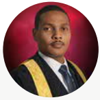
Senator the Hon. Nigel de Freitas

President of the Senate, Parliament of Trinidad and Tobago